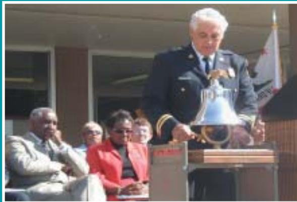
Front cover: The Richmond-San Rafael Bridge.