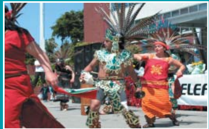
Right: 2002 Cinco de Mayo Festival. 60,000 people attended the City's four annual major festivals sponsored by the Recreation and Parks Department to celebrate Richmond's cultural heritage and diversity.