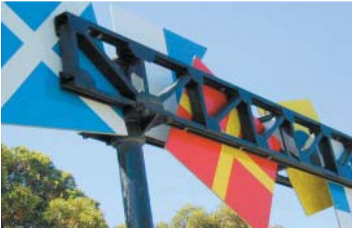
"SIGNALMEN," (detail), by Bay Area artist Anita Margrilla, is a promised gift from the Catellus Corporation. The maritime signal, located at Marina Way South and Regatta Boulevard, flags spell out "Marina Bay, Richmond."