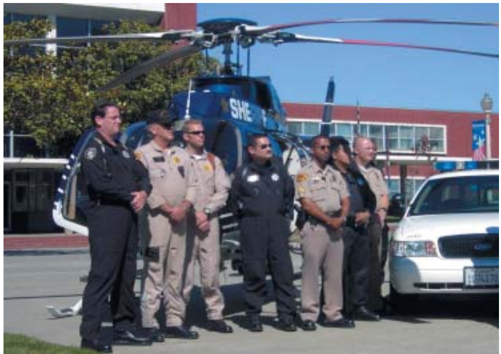
The Richmond Police Department will soon use a state-of-the art helicopter and special joint enforcement team from the Contra Costa County Sheriff's Department to respond more efficiently to criminal activity.

If you want to report a non-emergency item or offer an anonymous tip, the City of Richmond's Public Safety and Public Services Standing Committee reminds you to please call the Richmond Police Department Customer Service hotline (800) 459-5222 . A representative will assist you during normal business hours from 9 a.m. to 6 p.m. After hours, you may leave a voicemail message for future follow-up.